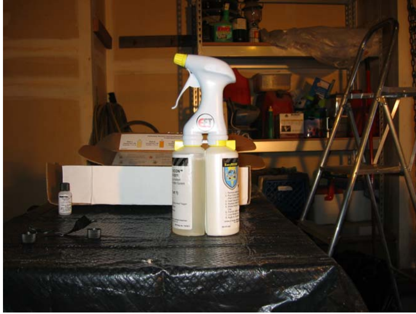
Figure 7. The EasyDECON solution application unit after assembly and prior to surface treatment.

This portion of the experiment was conducted in the same manner as the above two oxidizers except that the product was applied with the spray bottle that was provided and then let sit for a period of at least 30 minutes in a wet state. The product was then allowed to dry and the samples were collected in the same manner as in the previous samples. Samples were only taken from the painted drywall material. Seven samples were collected prior to treatment and after treatment, resulting in a total of 14 samples being taken from each of the drywall panels. Each sample consisted of a 100 cm 2 area being sampled from the panel using a 3"x 3" cotton swab to which 3 ml of methanol were added. After sampling the wipe was then put into a plastic centrifuge tube and sent to the laboratory for analysis as in the previous testing.