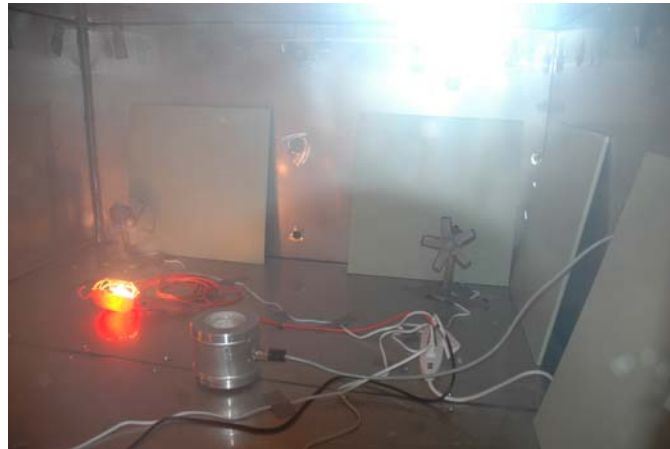
Figure 2. Painted drywall material being contaminated within the chamber.

The methamphetamine utilized for contamination was a street-manufactured methamphetamine provided by the North Metro Task Force in Colorado. The drug was approximately 77% methamphetamine and also contained small amounts of amphetamine, ephedrine, and pseudophedrine. No MDMA or phenylpropanolamine were found to be present. The methamphetamine was put into a beaker and the chamber was sealed and the methamphetamine aerosolized in the chamber. The methamphetamine was completely aerosolized within a short time (listed above) and the beaker heater was turned off. The fans within the chamber were kept running for another period of time to assure even distribution of the methamphetamine. The chamber was then allowed to sit overnight and the material was removed the next day.