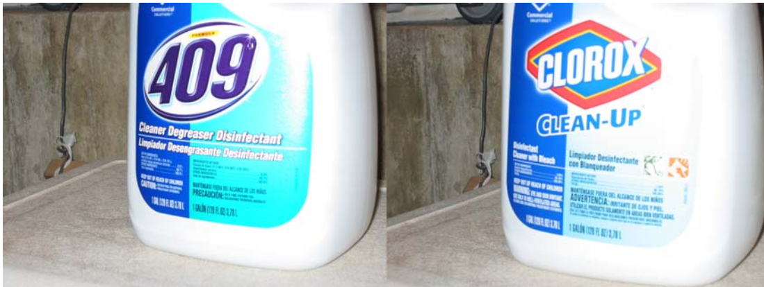
Figure 5. Pictures of the oxidizer cleaners utilized during this experiment.

After the collection of the pre-samples, the panels were then washed for the prescribed number of treatments using the appropriate cleaner. The cleaner was used according to label directions for a maximum degreasing. The cleaner was applied full-strength from a spray bottle onto the surface of the panel. The cleaner was allowed to sit on the panel for approximately 1.5 minutes and then it was washed off using clean water and a cloth. The surface was not scrubbed hard and no abrasive materials were utilized. After cleaning, the panels were allowed to dry completely before subsequent cleanings or prior to post sampling.