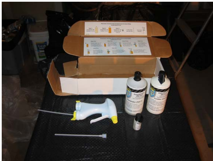
Figure 6. The EasyDECON kit containing the three-part decontamination material prior to assembly.

On January 19, 2009 the third experiment was conducted to determine if an oxidizing agent supplied by EFT Holdings Inc. and developed by Sandia National Laboratories would also be effective in reducing methamphetamine levels on painted drywall. This compound is labeled as EasyDECON and is supplied in three parts by the manufacturer. The three parts include a Penetrator that is a quaternary ammonium product, a Fortifier that is a liquid hydrogen peroxide, and a Booster that is labeled as a diacetin in the MSDS. The three parts are added together immediately prior to spraying them onto the surface. The manufacturer also does not require that the compounds be removed from the surface but does require a 30 minute contact time in which the surface must be wet. The product is a foamy material when applied to the surface.