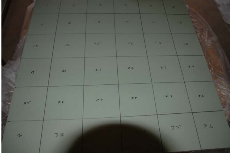
Figure 4. Panel prepared for initial pre-sampling after contamination.

After the collection of the pre-samples, the panels were then washed for the prescribed number of treatments using the appropriate cleaner. The cleaner was used according to label directions for a maximum degreasing. The cleaner was applied full-strength from a spray bottle onto the surface of the panel. The cleaner was allowed to sit on the panel for approximately 1.5 minutes and then it was washed off using clean water and a cloth. The surface was not scrubbed hard and no abrasive materials were utilized. After cleaning, the panels were allowed to dry completely before subsequent cleanings or prior to post sampling.