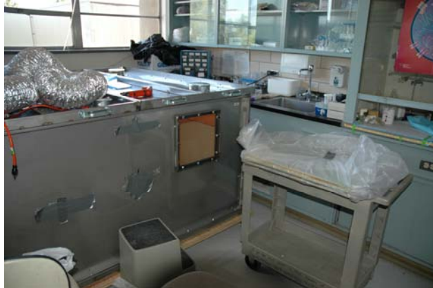
Figure 3. Drywall being removed for transportation to an area to be sampled and treated.

After being transported, the initial panels were divided into 2 groups of three for testing. The groups were as follows: